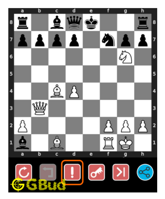
Figure 10: Click the help button to get help on next move @ https://gbud. \rm in/gqs76d1