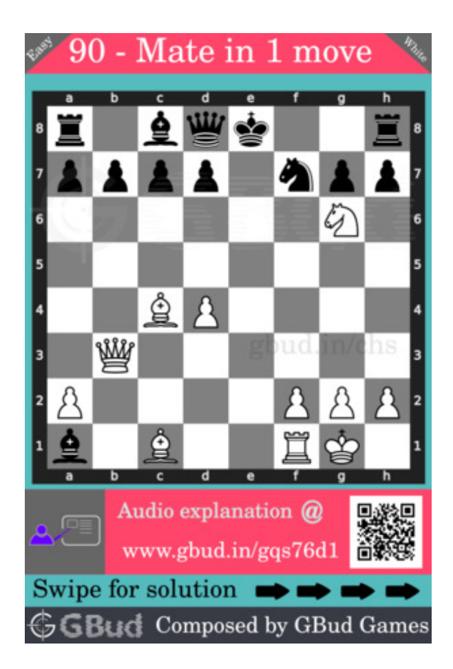
Figure 5: easy chess puzzle 90 chart 1