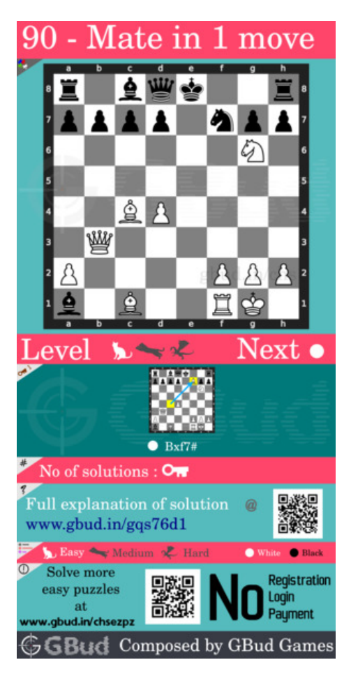
Figure 6: easy chess puzzle 90 chart 2 \,