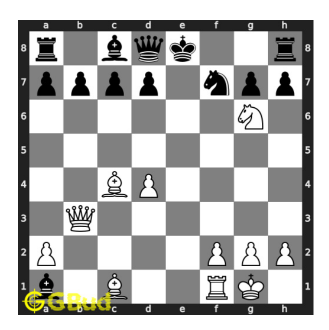
Figure 3: Initial board position of easy chess puzzle 0090

Initial board position This is the initial board position of easy chess puzzle 0090.