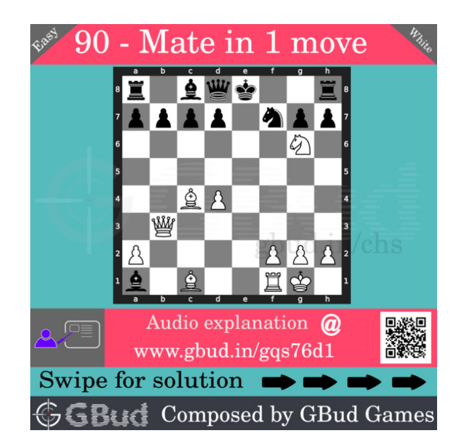
Figure 7: easy chess puzzle 90 chart 3